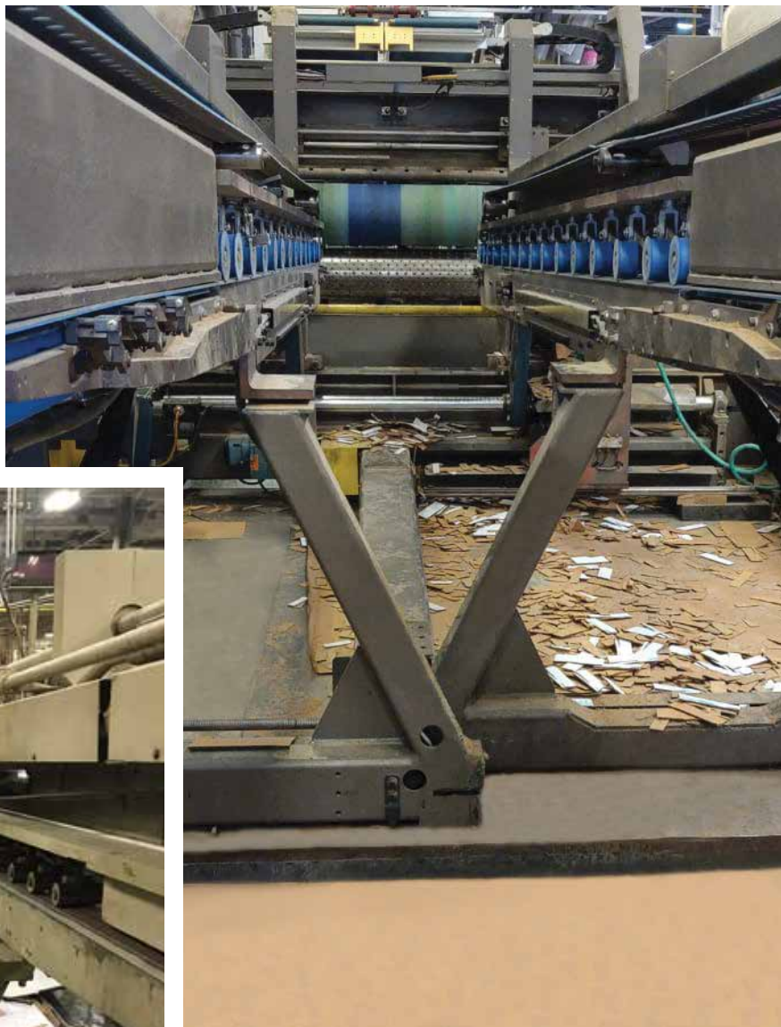
A 2019 FLEXP FOLDER-GLUER