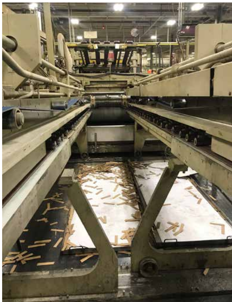
A 1984 VINTAGE FLEXP FOLDER-GLUER

Despite its shortcomings, the hold-down roller concept continues to be the primary choice of today's OEMs.